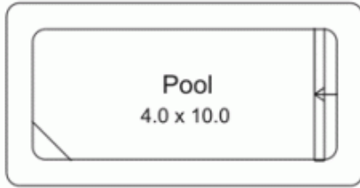
Pool not in actual position to house.