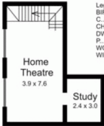
Home Theatre & Study beneath family and meals area