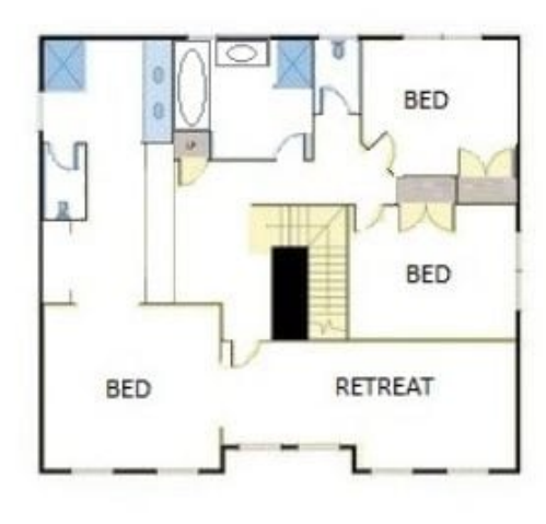
2 The Boulevard, Gisborne

Whilst every effort has been made to ensure the accuracy of this floorplan, no responsibility is taken for any error, omission or mis-statement.