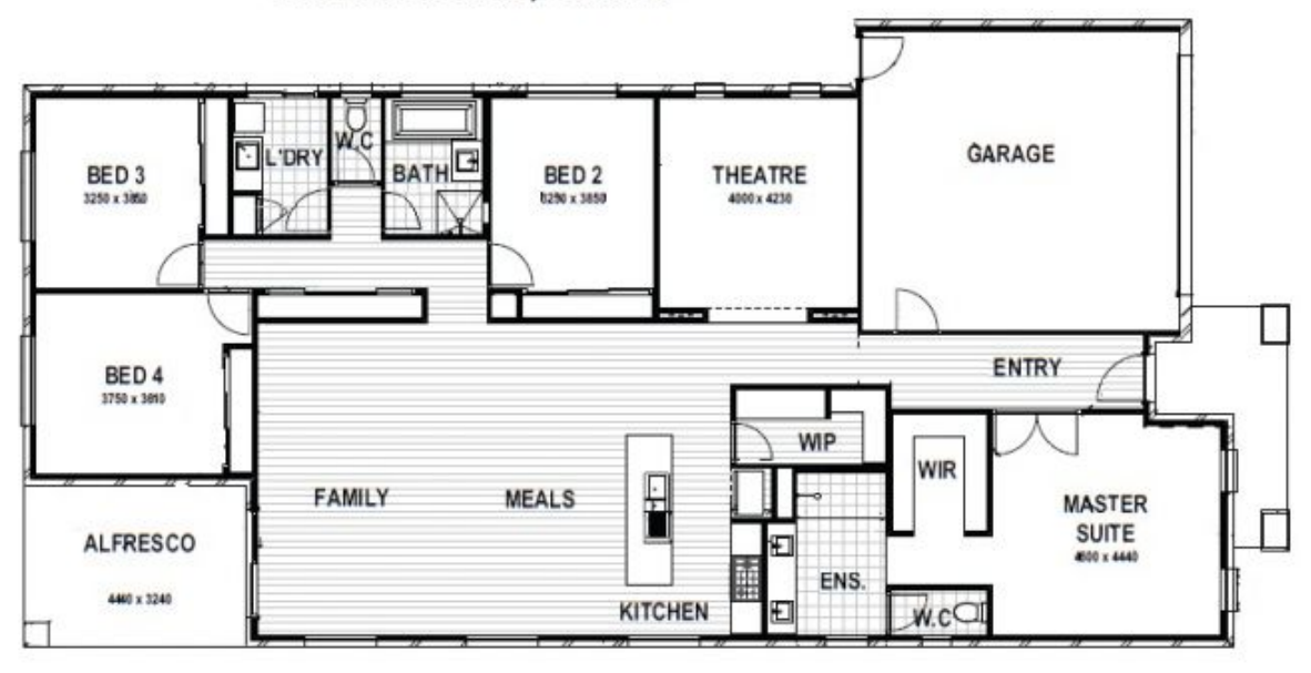
Whilst every attempt has been made to ensure the accuracy of the floorplan, no responsibility is taken for any error, omission or mis-statement. This plan is for illustrative purposes only, and should be used as such.